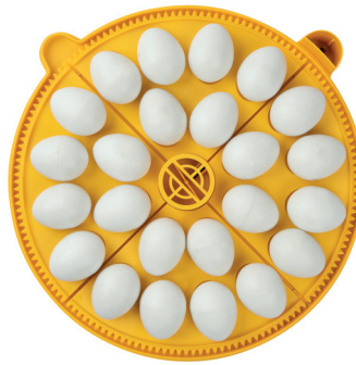
Ideal for 24 hens' eggs