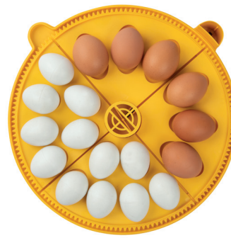
Quadrants of different sizes can be used

The egg quadrants come in four variants for different sized eggs; quail, hen, duck and goose. The Maxi 24 Advance comes with the hen and duck quadrants supplied as standard, the Maxi 24 EX has the quail, hen, duck and goose quadrants supplied. These quadrants simply clip together and can be mixed and matched to allow the user to incubate eggs of different sizes.